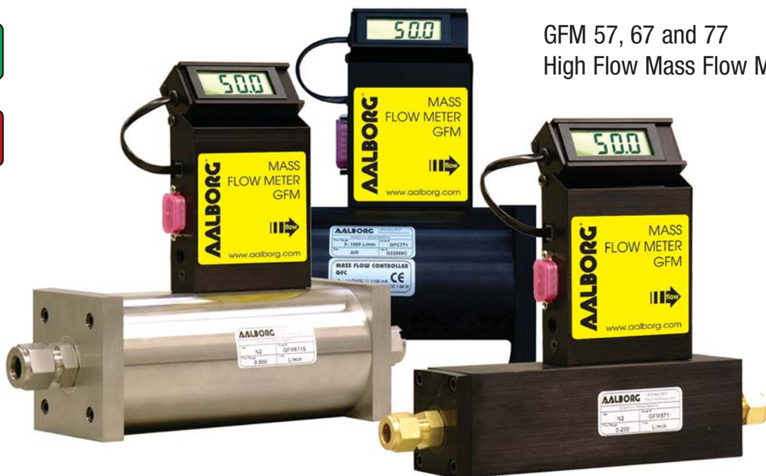
GFM 57, 67 and 77 High Flow Mass Flow Meters